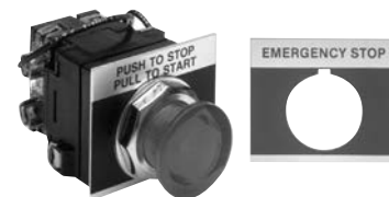
Mushroom-Head Illuminated Push-Pull Push Button