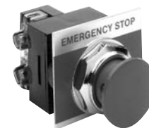
Mushroom-Head Non-Illuminated Push Button