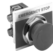
Mushroom-Head Non-Illuminated Push-Turn-to-Release Push Button