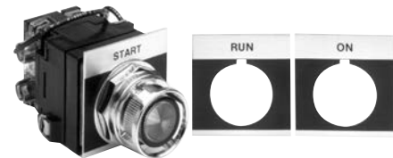
Standard Illuminated Push Button with Guard