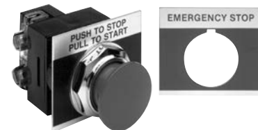
Mushroom-Head Non-Illuminated Push-Pull Push Button